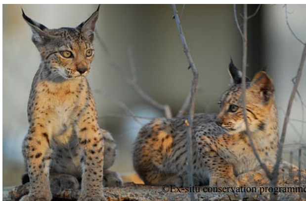
Castañuela and Camarina at El Acebuche

There are at present 24 lynxes in the captive breeding programme in Andalucía: 18 in El Acebuche, 5 in Jerez and 1 recently incorporated cub, to be the first inhabitant of the recently finished new centre in Jaén province. This cub was found abandoned at the age of 4 months on a patio of a house in the Sierra de Andújar on 14 September. Cardo is another recent inclusion in the captive breeding programme, captured as a cub from the wild in the Sierra Morena on 6 July 2006.